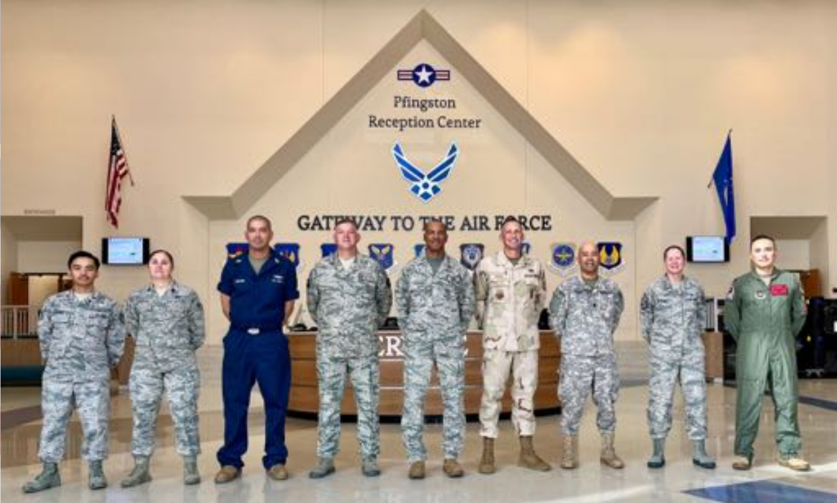
On Monday, Nov. 6, several members of the Gateway Wing, civilian and military, paid tribute to Veteran's Day by wearing a uniform they had previously worn while serving in a deployed location. Wear of the uniforms was authorized wing-wide to pay homage to those who have previously served and to build camaraderie with those currently serving.